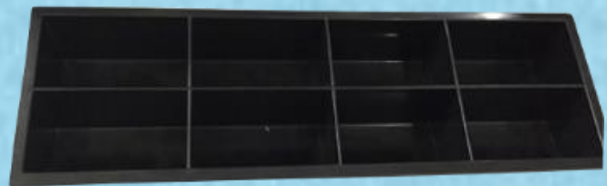
8C-Fixed Removable Coin Tray is also available