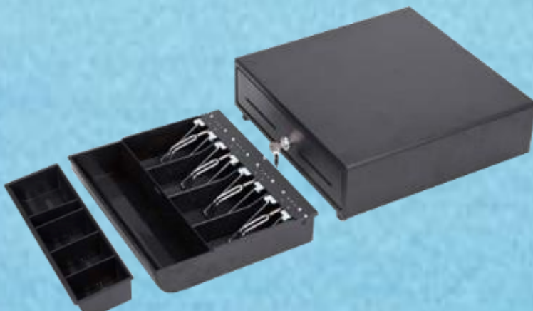
Removable Cash Tray & Coin Tray