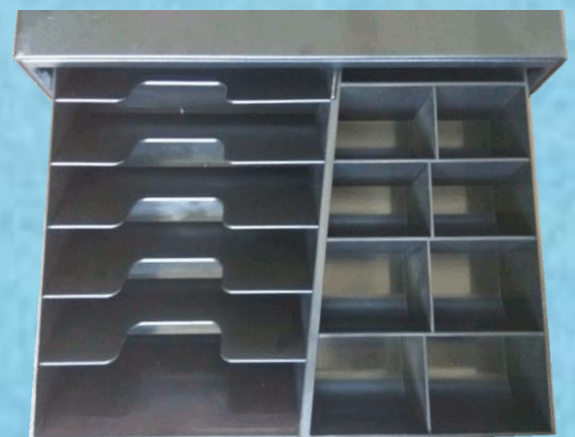
8C/6B Euro Vertical Cash Tray